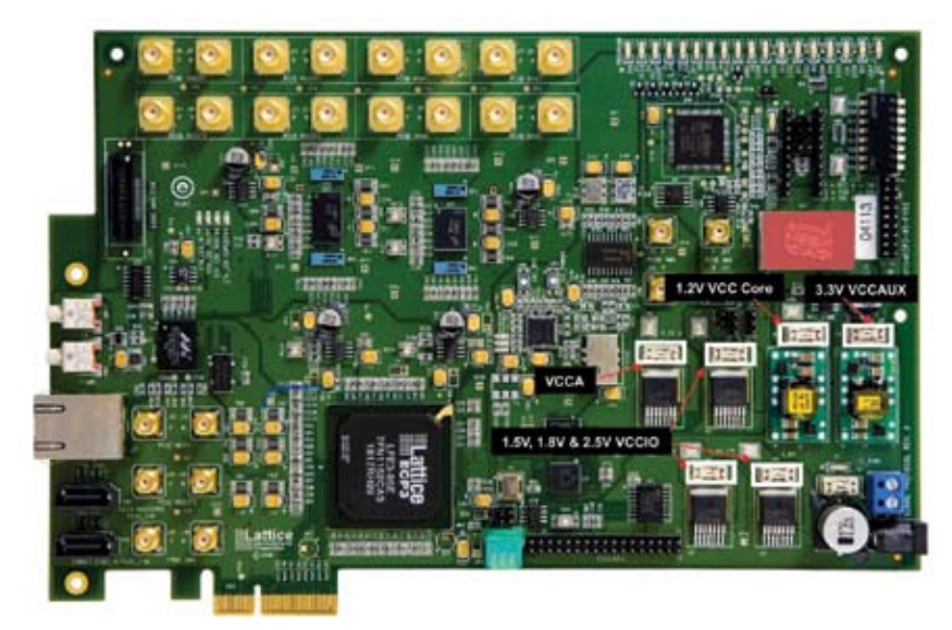
Figure 2 Development boards, like this one from Lattice Semiconductor, often provide low-impedance access points for monitoring current on the FPGA's supply rails.

is an interesting issue. "These tools have really improved recently," Kothandaraman says. "Years ago, there were lots of correlation problems with the tool results. But today, you can expect your early estimates to be within 20 or 30% of the final power consumption."